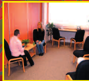
DISC project worker in session with a client in the private consultation room and communal area.

Coordinating the provision of care by other agencies and professionals.